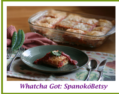
Whatcha Got: SpanakóBetsy

extraneous food. I can't tell you how many times my husband has hounded me to clear out the refrigerator of myriad half-packages of cheese!